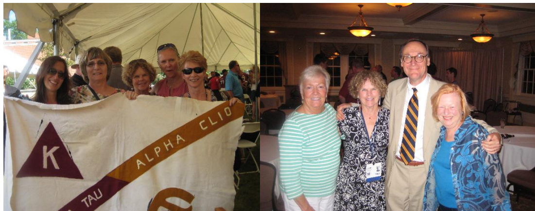
Clio's at the DK gathering!